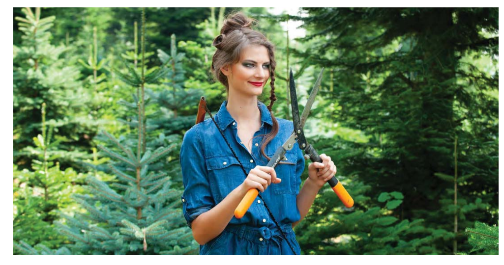
In case the item you are looking for is not listed here, please contact us. All prices plus VAT ex warehouse. For larger quantities, please request an individual offer.